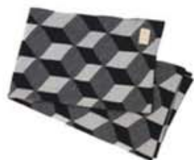
The Squares Blanket by Ferm Living: $149.95; Velocity Art & Design