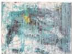
Cloudy Abstract Acrylic on Canvas: $1,800; FLAIR Home Collection