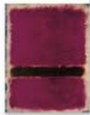
Untitled, 1963 by Mark Rothko: $27.99; Art.com