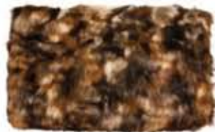
Limited Edition Spotted Wolf Faux Fur Throw: $269; Donna Sabers' Fabulous Furs

Loring 89" Sofa from Room & Board. Loring captures everything you love about classic design and updates it for today's living. The incredibly soft velvet is reminiscent of a genteel era, while stainless steel accents on the feet add a modern touch.