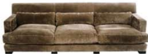
Tea Time Sofa: $5,100; Interiors