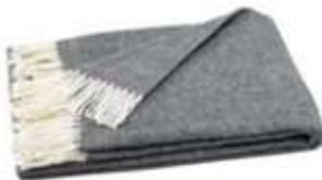
Charcoal Herringbone Throw: $90; Z Gallerie