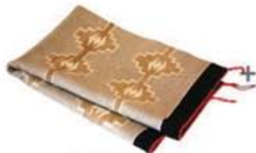
Navajo Chinle Rug: $305; Medicine Man Gallery