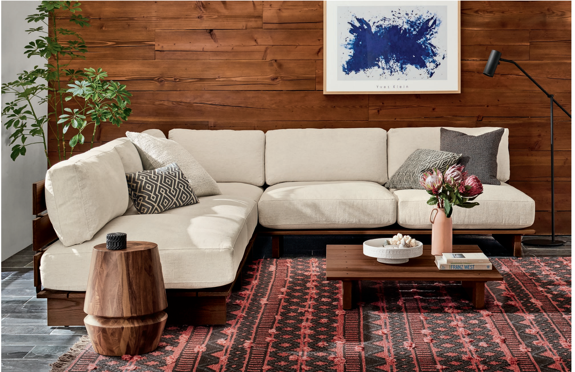
Span 109"x109" three-piece modular sectional in Towson ivory.