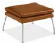
24w 21d 15h ottoman