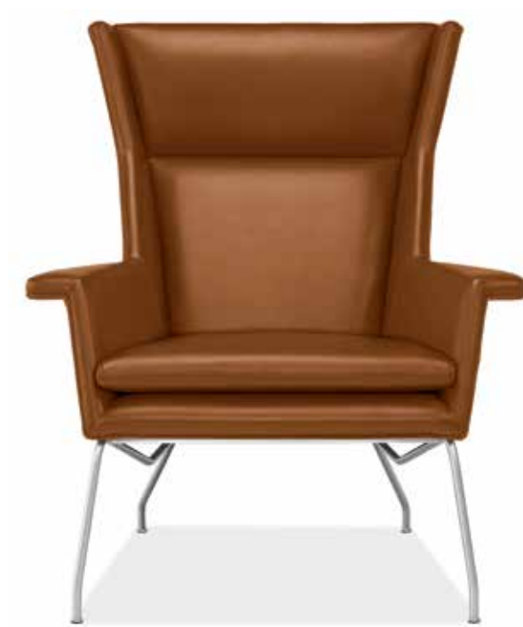
Aidan chair in Vento cognac with stainless steel legs