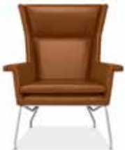
35w 35d 39h chair