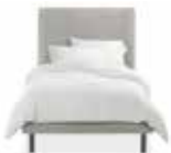
44w 84d 43h twin bed*