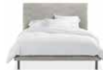
82w 89d 46h king bed (queen bed shown)