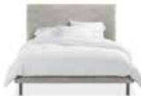
59w 84d 46h full bed (queen bed shown)