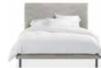
76w 93d 46h california king bed (queen bed shown)