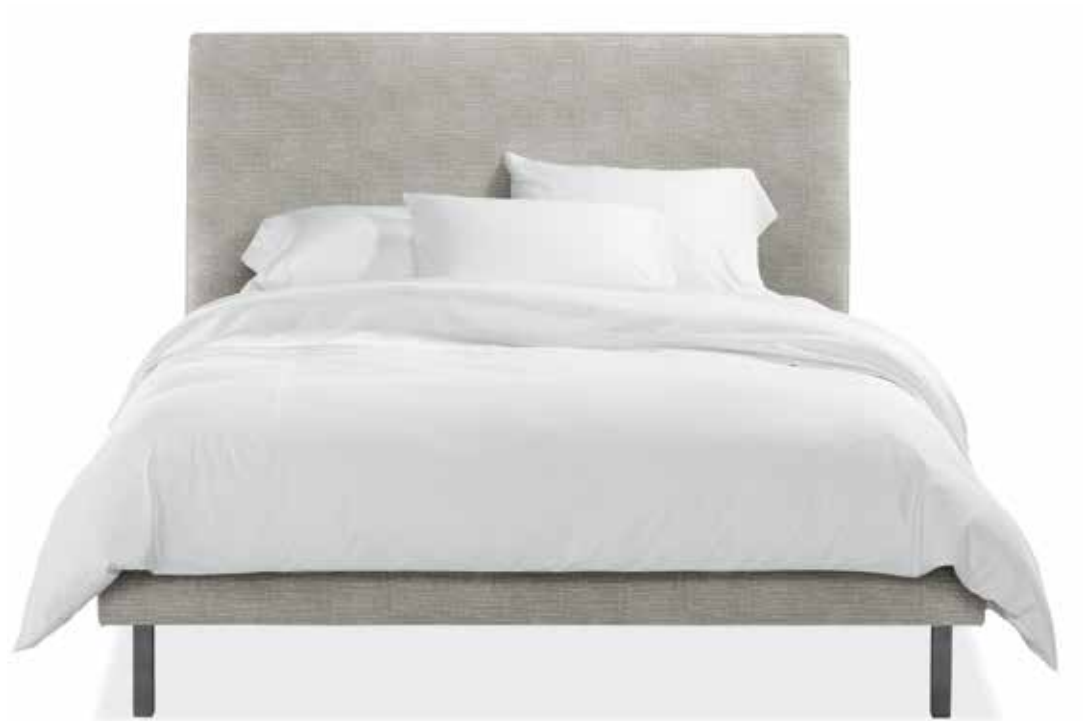
Ella queen bed in Destin grey with natural steel legs