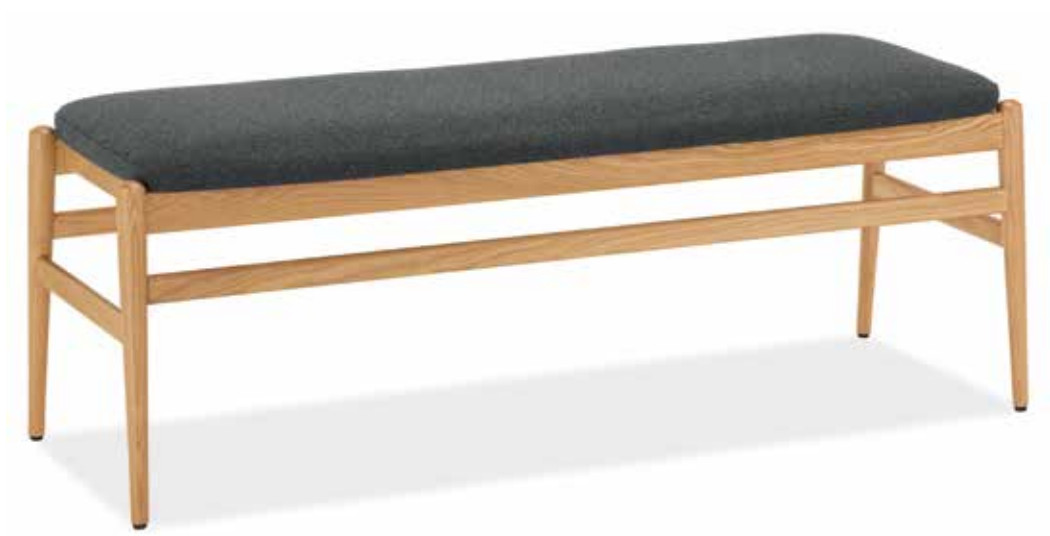
Evan 54w 19d 18h bench in Flint charcoal with white oak base