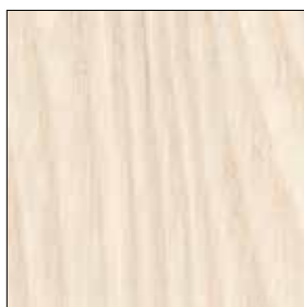
Ash with sand stain