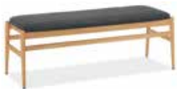
54w 19d 18h bench