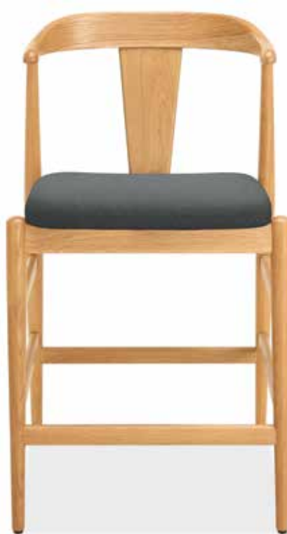
Evan counter stool in white oak with fabric seat in Flint gunmetal