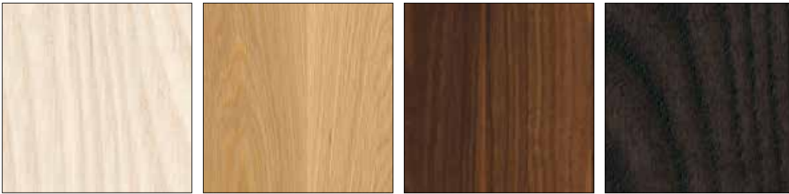
Ash with sand stain