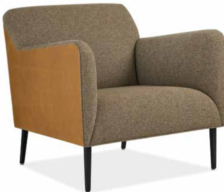
Matteo chair in Tatum wheat/Vento camel