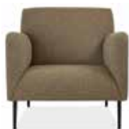
33w 35d 31h chair