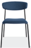
21w 21d 32h stackable chair