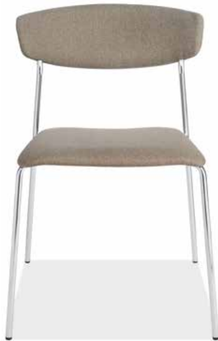
Wolfgang stackable dining chair in Medley oatmeal with chrome legs